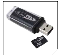
Micro SD and USB reader (SD card and USB not incl.)